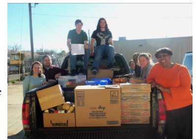
Everyone jumped in to help put away a HUGE food pantry donation that came in from one of our supporting churches!

at the Savannah Baptist Center. When you leave you realize you may have been a blessing to some hungry person but you have been blessed immeasurably.