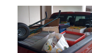
Schools who received truckloads of school supplies: Spencer Elementary, East Broad Elementary, Gadsden Elementary