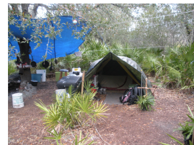
Many of those who come to the Center on a weekly basis, looking for help and attending the church, live in make-shift tents