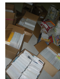
193 Churches from 19 States Donated Items to the Center as a part of the Christmas in August program